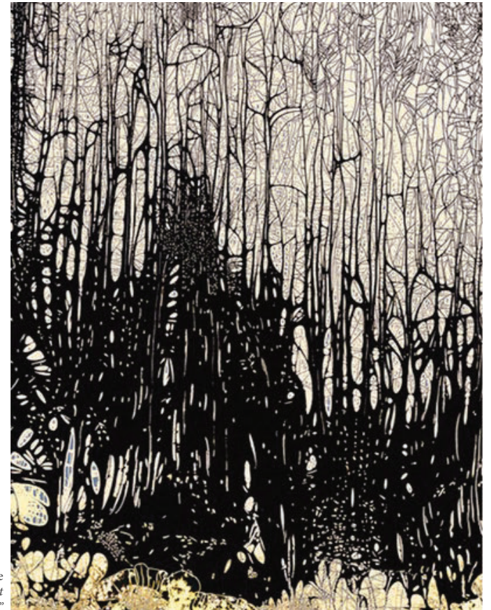
Nolan Preece In the Thicket 21" x 15"

John Lyon Paul uses bits and pieces of crosscut, rough-cut and repurposed wood to create moving abstractions. His assemblages, with their converging patterns and dynamic designs, breathes life back into the extracted wood, which at times, may result in referential subjects such a young and watchful deer or a curiously complex cabinet. The main intent here is the beauty and diversity of wood in an age where we are moving more and more into plastic covered technology that is absolute even before you get it home and open the packaging. Wood somehow breeds comfort, it has its mystery for sure, yet we can understand it on a level that is both familiar and fundamental.