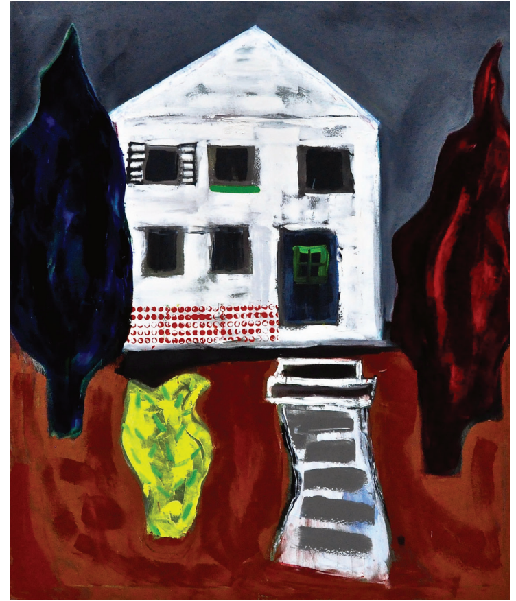
Brenda Giegerich Inside Outside (2017) 60" x 48"

Sandra Gottlieb's haunting and hypnotic photographic studies of clouds seem to bring all the powers of nature into one single moment. The fiery forms filled with volcanic moisture pose many thoughts of a climate gone awry, while the majesty of the shapes and the sheer volume captured cannot be fully grasped in practical terms. Some suggest we should look to the sky, to the heavens for answers, yet the information we seek can bring concern or doubt about our planet's future. So we look up and take in a sunset, a sunrise or a pristine blue sky and wish, or better yet, insist that this must never end.