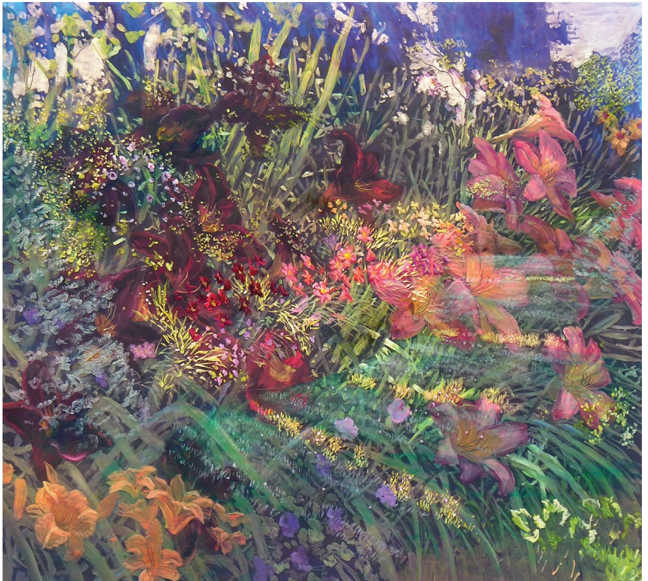
Martin Weinstein Lily Beds, Evenings (2012) 37" x 40"

The complexity of Martin Weinstein's paintings create a dreamy atmosphere as nature is presented as a multiverse of time and space, even though there is more than enough familiarity in these voluminous vistas to keep the viewer grounded in the here and now. Moving from detail to atmosphere, then back to detail, Weinstein takes us on a whirlwind tour of our natural environment whether it is slowly seeping into our unconscious mind or inspiring us in our thoughts and waking dreams. And it is that dreaminess, that alternative awareness that attracts us to these works, as they are a perfect combination of memory and reality.