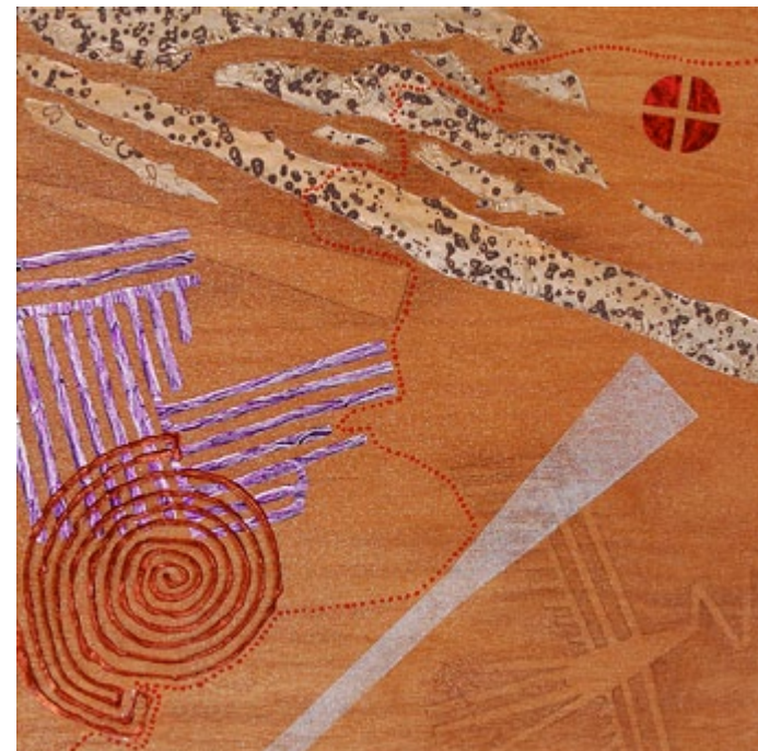
Forbidden Path, by Leila Daw

Maps communicate all kinds of information as shown by Leila Daw's Flow, Stick Charts and Map Icons series. She presents a broad range of maps to include climate maps that chart levels of rain and snow; physical maps that record the features of the landscape to include mountains, rivers and wetlands; and maps that identify the stars in the night sky. The compass roses are left unmarked by the cardinal points of North, South, East and West to emphasize how maps can "dislocate" or skew information. Daw says "How can we know where we are in the world, when what we are looking for determines what we see?" 6 Daw fashions contemporary stick charts, putting a twist on those historically constructed by Polynesian sailors to record wave swells, and to navigate the vast expanse of water that separates the many islands. These maps are so personal they only serve to guide the maker.