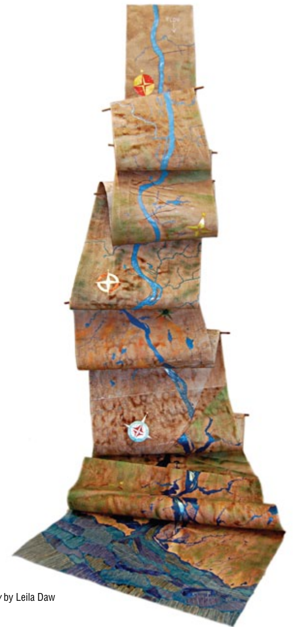
Flow by Leila Daw